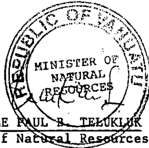
HONOURABLE PAUL B. TELUKLIK Minister of Natural Resources

MADE at Port Vila this 1st day of July 1992.